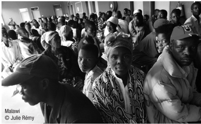
Malawi

More potent and better-tolerated first-line antiretroviral regimens like those including tenofovir are essential to providing quality AIDS care and must be made affordable and available in developing countries. There is increasing evidence of serious, long-term side-effects from some of the most commonly used first-line antiretrovirals, especially stavudine. 9 Access to first-line regimens containing tenofovir is an urgent priority. 10 However, tenofovir still remains very costly and unavailable in the majority of developing countries, despite having been registered in the US since 2001.