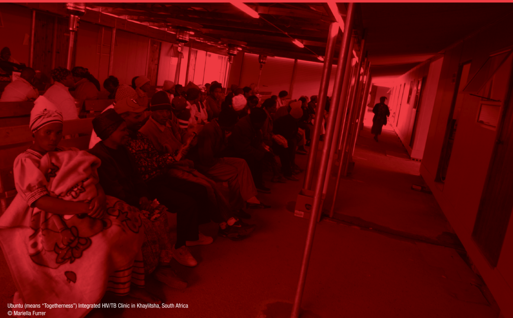
Ubuntu (means "Togetherness") Integrated HIV/TB Clinic in Khaylitsha, South Africa

Rue de Lausanne 78 Case postale 116 1211 Geneva 21 Switzerland