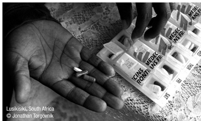
Lusikisiki, South Africa